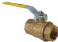
GAS SELECTOR VALVE