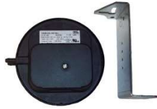
AIR PRESSURE SWITCH