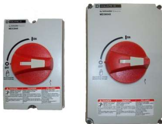
FV-731 – 3 PHASE FV-732 – 1 PHASE