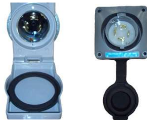
FV-730 – 1 PHASE FV-730A - COVER FV-729 – 3 PHASE