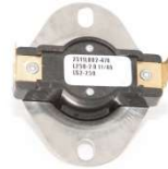
FV-706 – 250F FV-707 – 200F